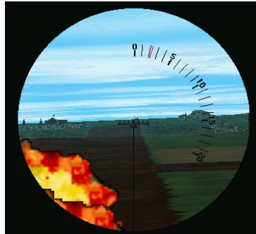
Range Finder view

To determine the range to a target, use the page up and page down keys (possibly labeled PgUp and PgDn on your keyboard) to increase or decrease the range finder setting. Note that these are not the page up and page down keys located on the numeric keypad, but those located to the left of the keypad on extended keyboards. If your joystick is equipped with a "hat" switch, you can also use this to adjust the range finder setting. When you do this, the second cross will move to the left or right. When the darker cross lines up behind its mate, the range finder will have been dialed in for that target. All you have to do now is note the position of the red needle in the distance scale and you will have the range to your target. If you have more than one target in your sight, you can quickly determine the range to each by lining up its two targeting crosses.