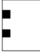
Align Left *Page*