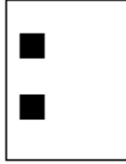
Align Left *Object*