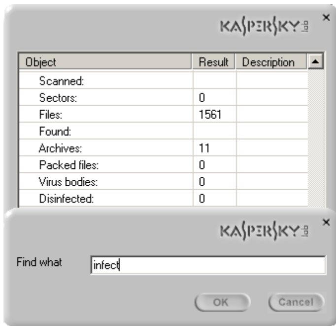
Search entry window

The line symbols (letters, numerals, symbols) which need to be found must be entered in the data field of the window, followed by pressing OK .