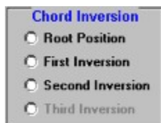
Chord Inversion box

For further information on types of chords, refer to any book on musical theory.