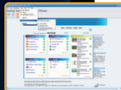
Download Accelerator Plus