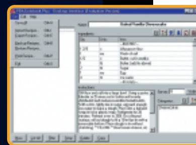
PDA Cookbook Plus