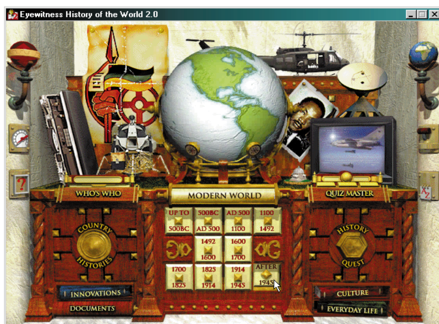
History of the World v.2: bite-sized chunks of information served in several ways keeps interest alive.

*Based on preview list at time of writing. ○ No ● Yes. ★ = Poor ★★ = Below average ★★★ = Average ★★★★ = Good ★★★★★ = Excellent.