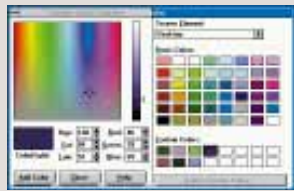
Fine tune your desktop colours from Control Panel

but harmless, bug. It also affects the Word for Windows word-counter, according to which this column consists of just one word.