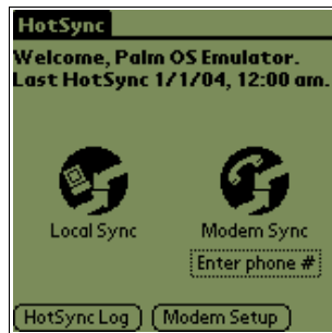
Illustration 1 HotSync® 2.0

Place your Palm™ device on the cradle and press the HotSync® button on the cradle. If your cradle does not have a HotSync® button, or you are using an infrared link or a special cable, you can begin a HotSync® by selecting the HotSync® application on the Palm™ device and tapping the double-arrow icon (shown below).