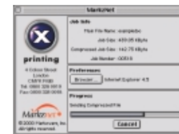
Markznet Transmission dialog box

"TFS" stands for "TrueFileSpec." Within this text file sits your preflight preferences and other information which will "control" the client versions out in the field with your customers or potential customers. Further job ticket data will be embedded in this file so that you can do what you like with this information.