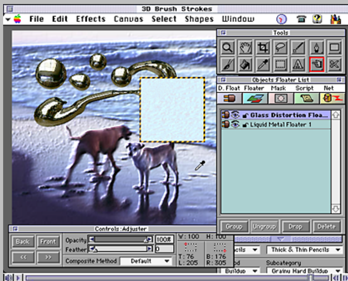
Painter 5 Training CD movie screen