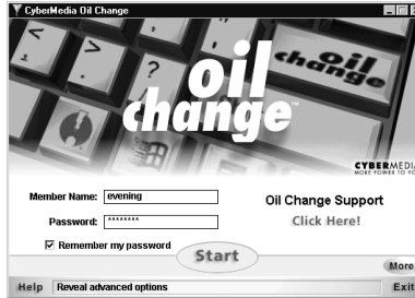
Figure 1-2. Main window without buttons

For more information about using these features, see the online help provided with Oil Change.