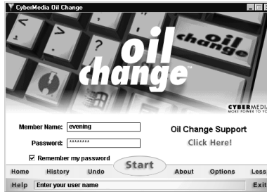
Figure 1-1. Oil Change main window

Most Oil Change features are accessible from the main window as seen in Figure 1-1.